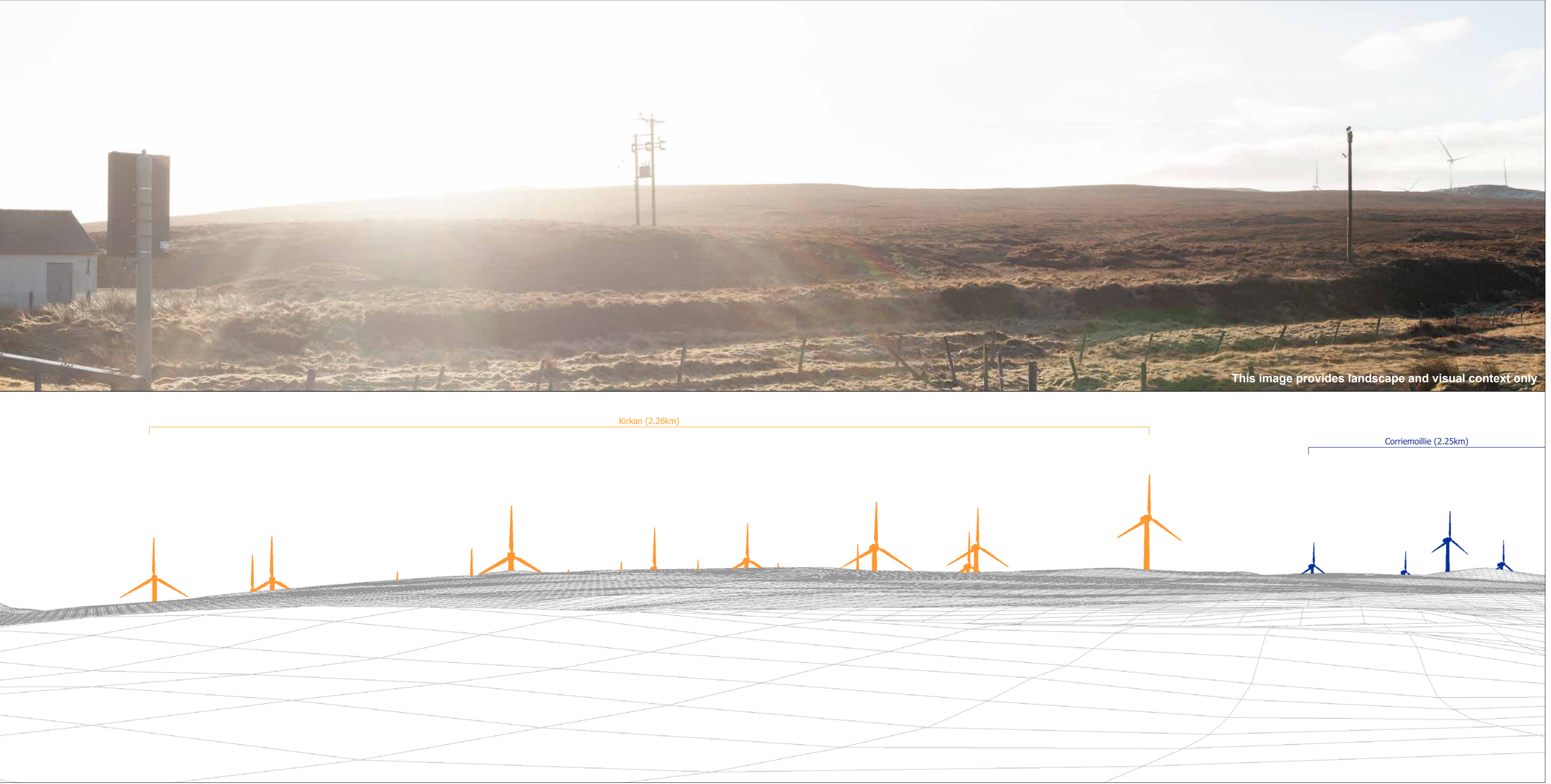
Figure: 9.21b - Amended Viewpoint 1: Aultguish Inn