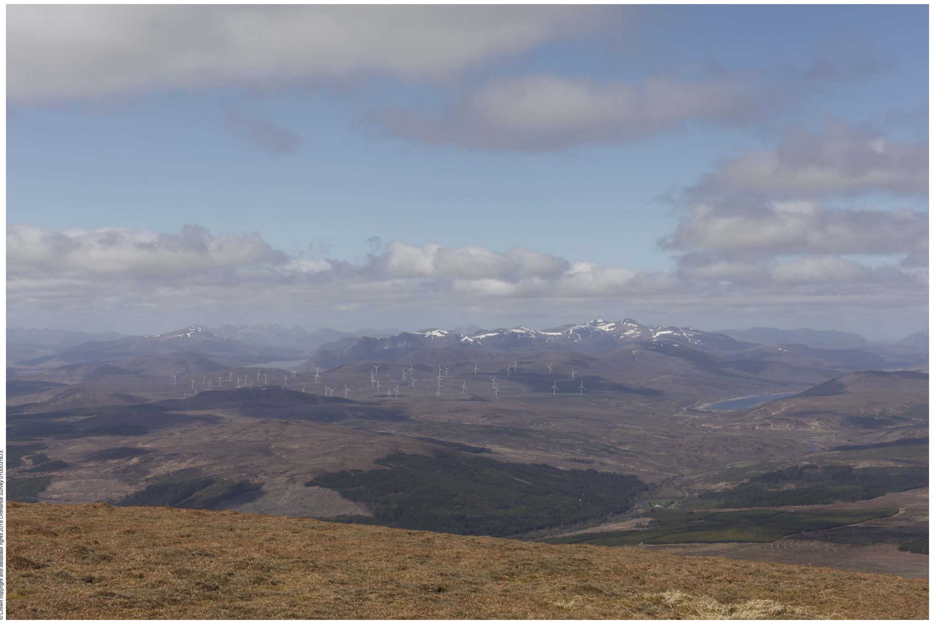
Viewpoint 5: Ben Wyvis (Glas Leathad Mor)