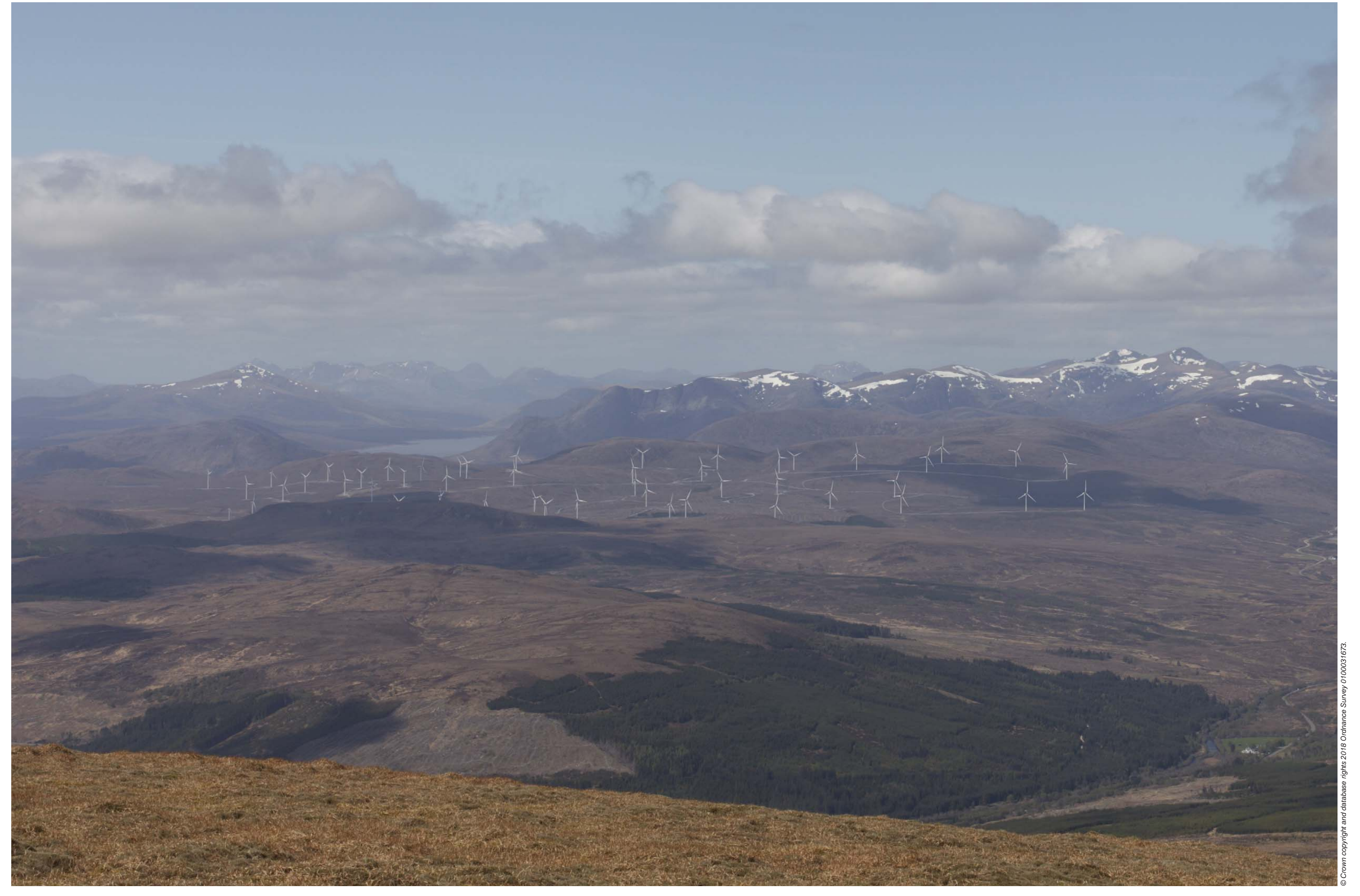
Viewpoint 5: Ben Wyvis (Glas Leathad Mor)