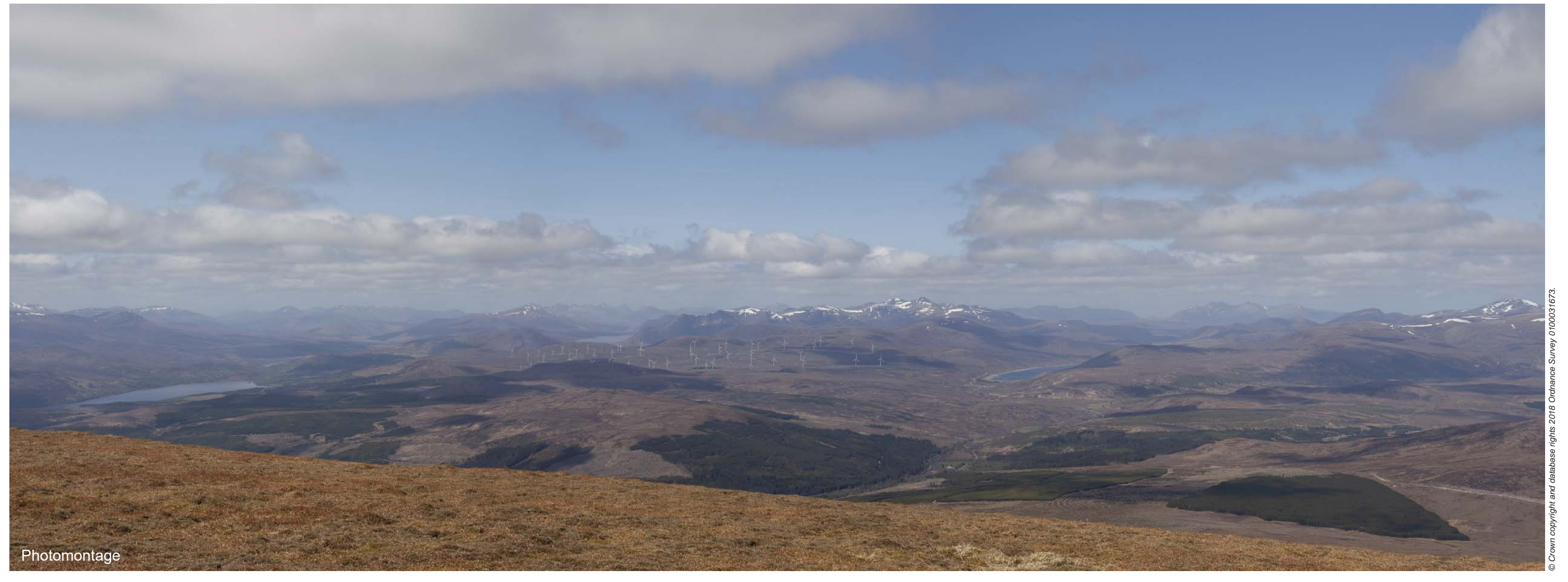
Viewpoint 5: Ben Wyvis (Glas Leathad Mor)