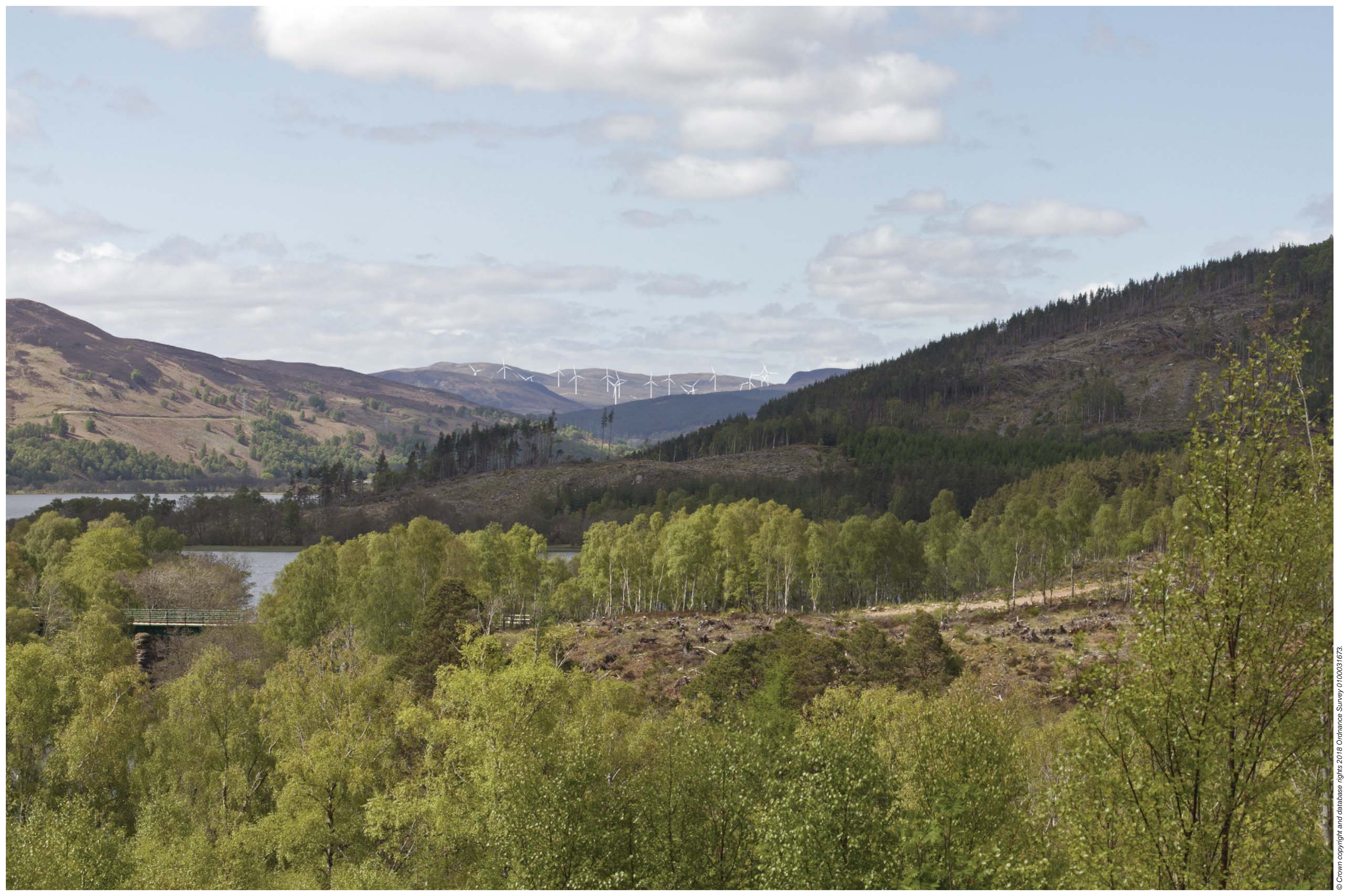
Viewpoint 3: A835, Garve Bridge