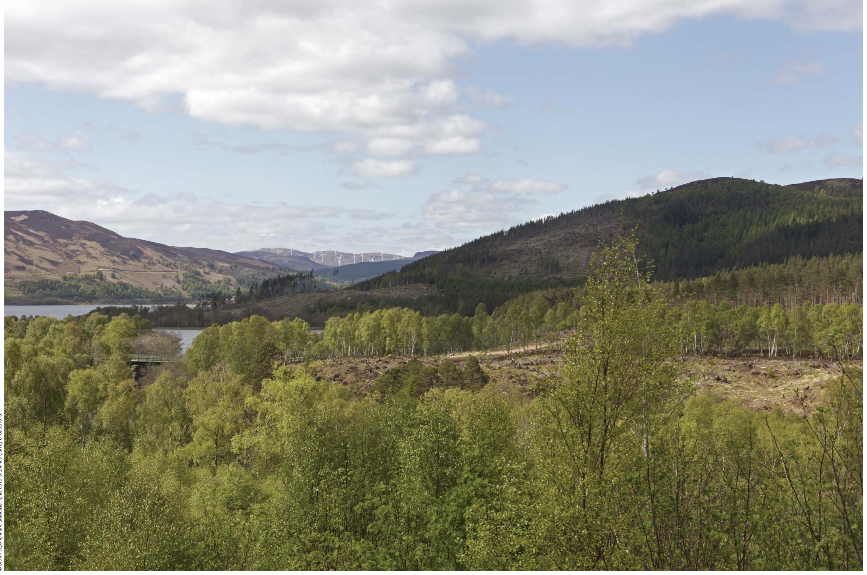
Viewpoint 3: A835, Garve Bridge