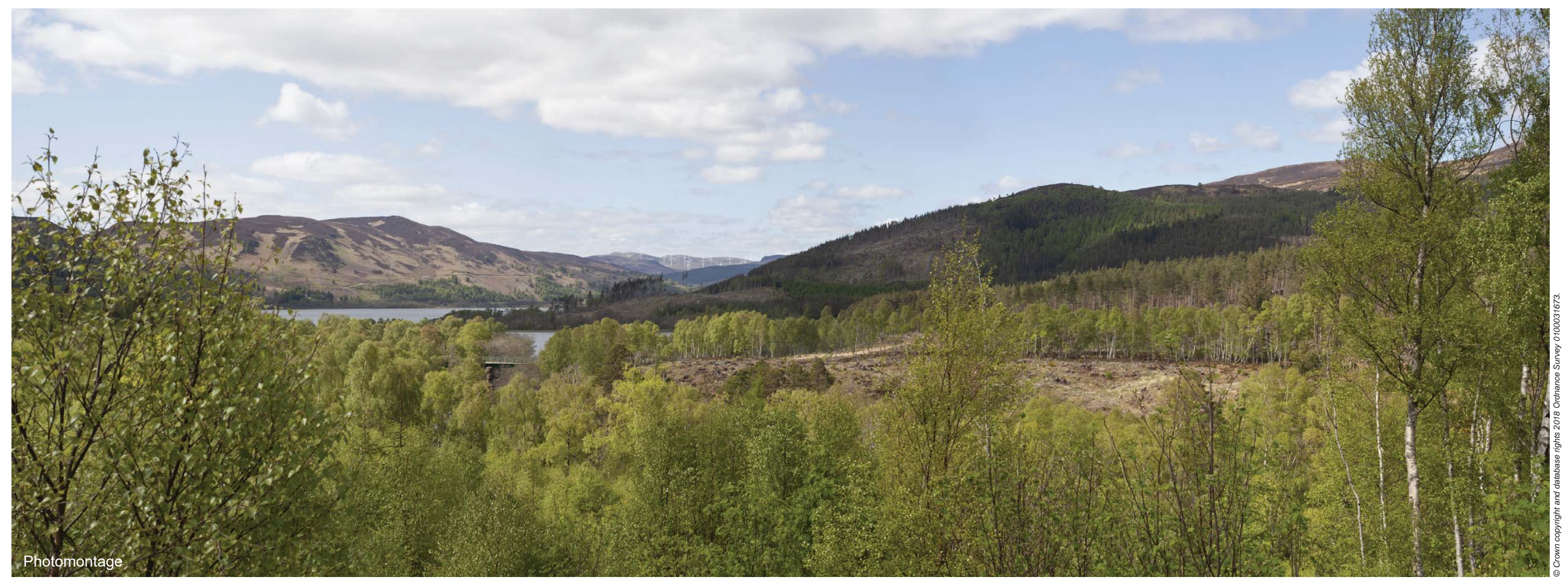
Viewpoint 3: A835, Garve Bridge