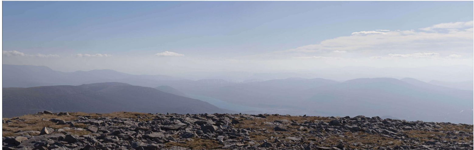
Existing view (existing turbines have been montaged in this view)