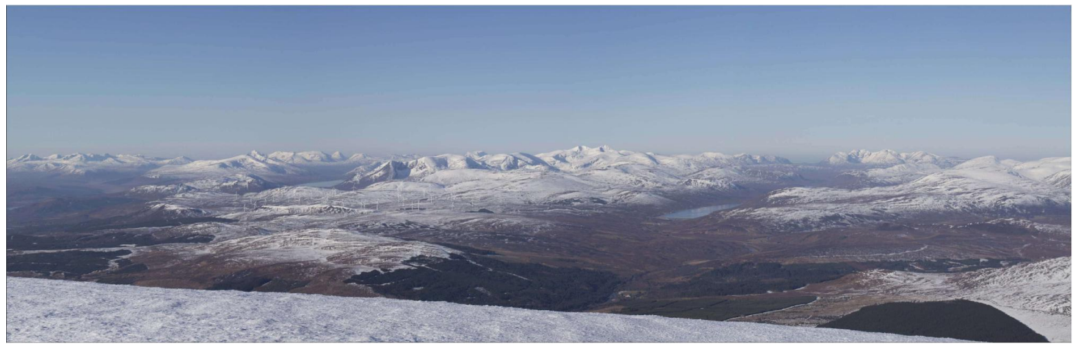
Existing view (existing turbines have been montaged in this view)

OS Reference: OS Reference: Eye level: Direction of view: Nearest turbine: Horizontal field of view Principal distance Paper size: Correct printed image sizes: Camera height: Turbine height (to tip):