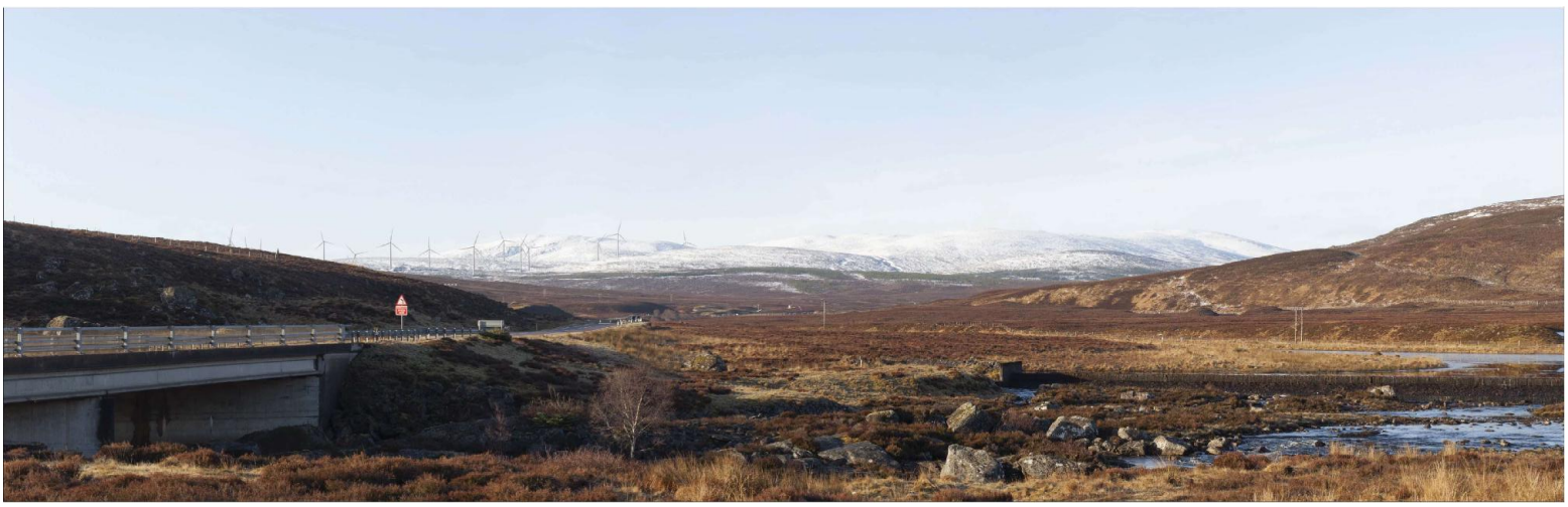
Existing view (existing turbines have been montaged in this view)

- 237349 E 870830 N OS Reference: OS Reference: Eye level: Direction of view: Nearest turbine: Horizontal field of view Principal distance Paper size: Correct printed image sizes: Camera height: Turbine height (to tip):