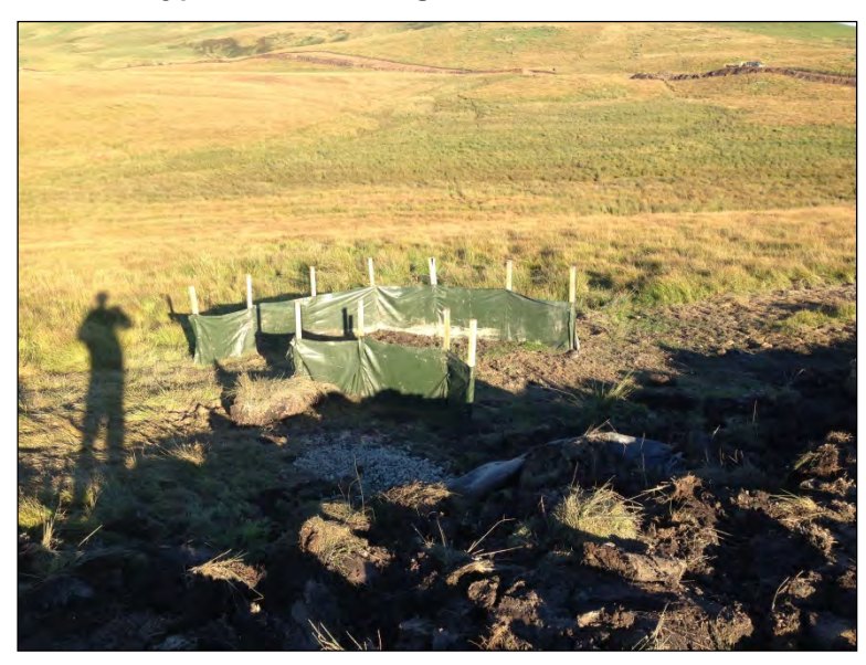
Plate 1: Typical silt fencing

Plates 1, 2 and 3 of this document display typical silt fencing, silt traps and silt matting.