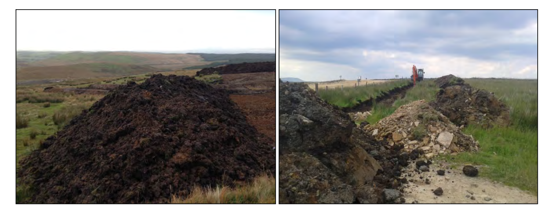
Plate 14: Typical overburden stockpile measures

Typical overburden stockpile measures are shown in Plate 14 of this document.