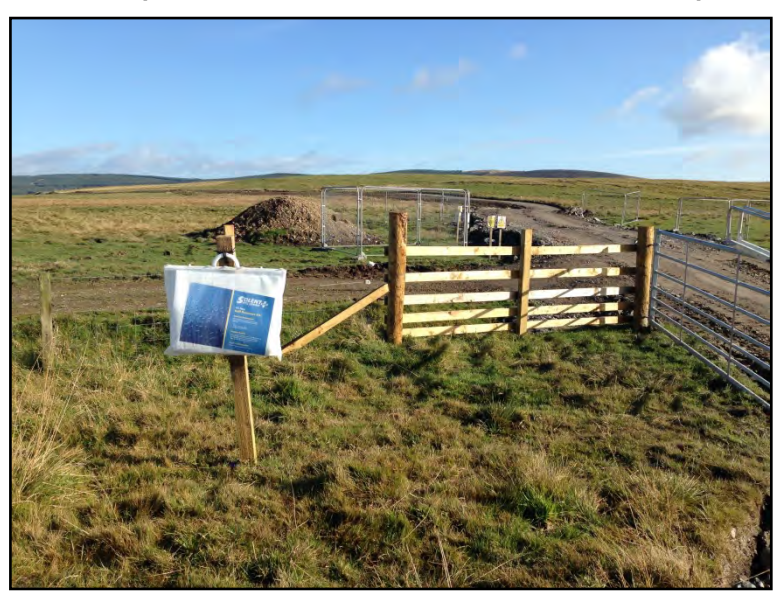
Plate 7: Spill Kits to be located across the Development

Spill kits will also be located at strategic points across the site, as displayed in Plate 7.