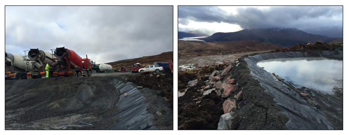
Plate 8: Typical concrete washout facility

In the event that plant and wheel washing is required, dry wheel wash facilities and road sweepers will be provided to prevent (as far as is practicable) mud and debris being carried from within the site onto the public road.