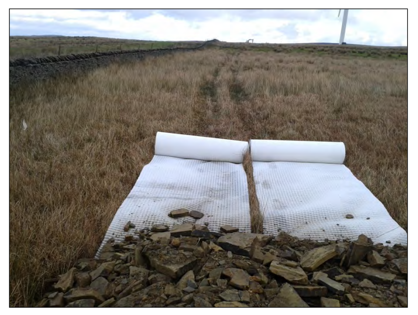
Plate 13: semi-permeable geotextile layer