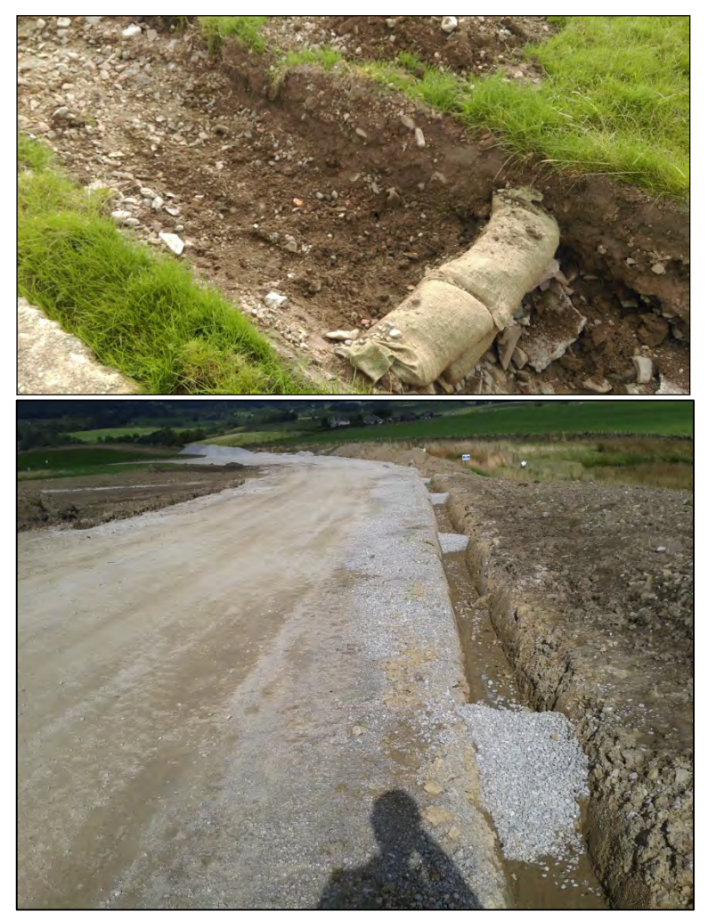
Plate 4: Typical check dams - to be installed in drainage ditches adjacent to the access track

Plate 4 of this document displays a typical check dam.