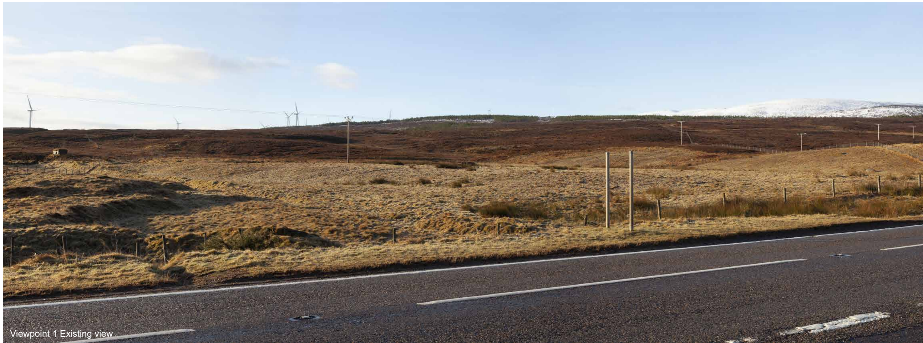
Viewpoint 1 Existing view